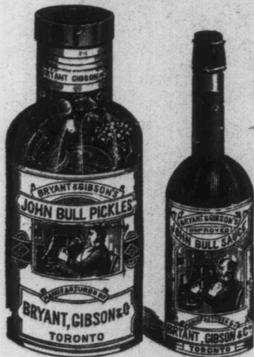
This is a facsimile of our bottles.

BRYANT, GIBSON & Co., TORONTO, Manufacturers of