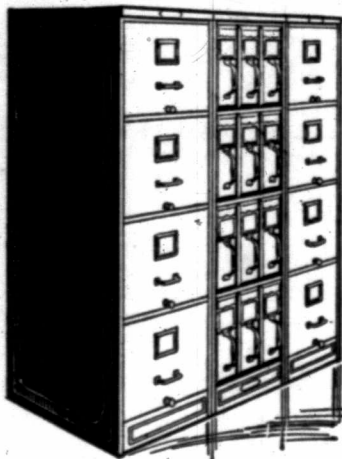
We Send Office Furniture all over Canada.