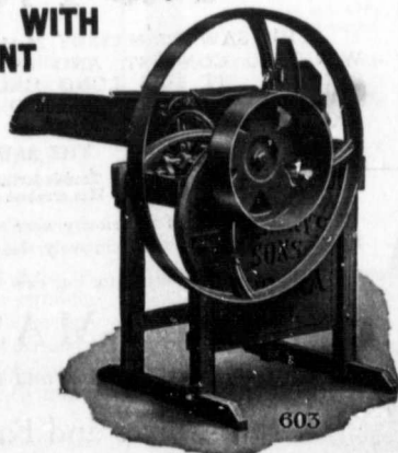
FLEURY STRAW CUTTER No. 2

We have a Fleury Straw Cutter to suit every possible requirement, from the small 8 inch feed Hand Lever Cutter to the large Ensilage machine with 14 inch feed, steel carrier feed table and elevating pipe, cutting and elevating from seven to 15 tons of corn per hour. These cutters are all in stock and they can be operated by Hand Belt or Rod Power.