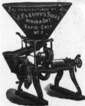
FLEURY "RAPID-EASY," No. 2

This machine is unsurpassed, not only for its great capacity and the uniformly excellent work it does, but for its structural superiority, the ease with which it is operated, and its lasting qualities. The feed trough is long and broad giving feeding and screening capacity equal to the rapid work of the grinder. 10 inch feed—also in 12 and 13 inch sizes. Baggers for this or any Fleury Grinder can be furnished.