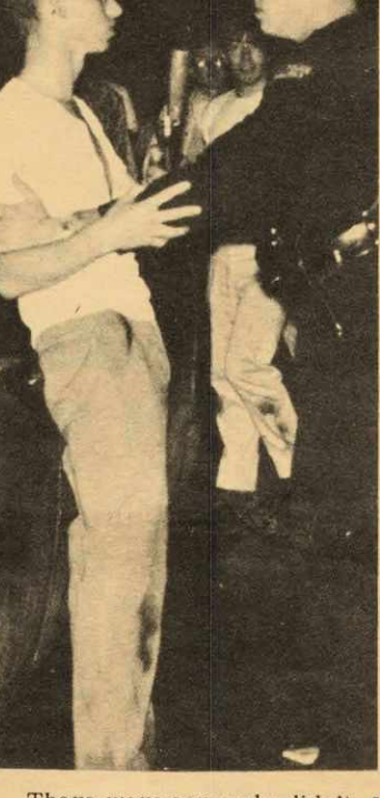
There were some who didn't run when the police arrived on the secene at the King's-Dal Residence Riot last week.

During the six months the comthe report, it studied briefs from the Art Gallery, Department of Evidences of greater student Music and Drama Workshop and