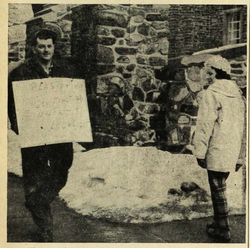
"He's not the only one who has trouble getting plastered."

As a reminder . . . a cake must be tasted, a book read, wine sampled, or a cigarette smoked, before it is condemned. Dalhousie's fraternities only request that the same concession be granted to them.