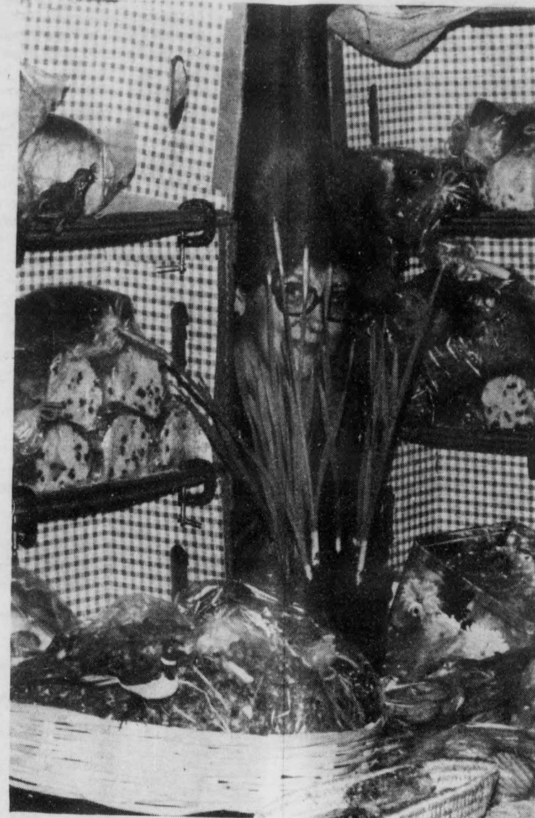
Mary Aitken hidden away in her little cubbyhole of goodies.

After wandering around a bit you might stumble upon a lady completely surrounded by a vast selection of baked goodies. This is Mary Aitken and last year she raised enough money for a trip to