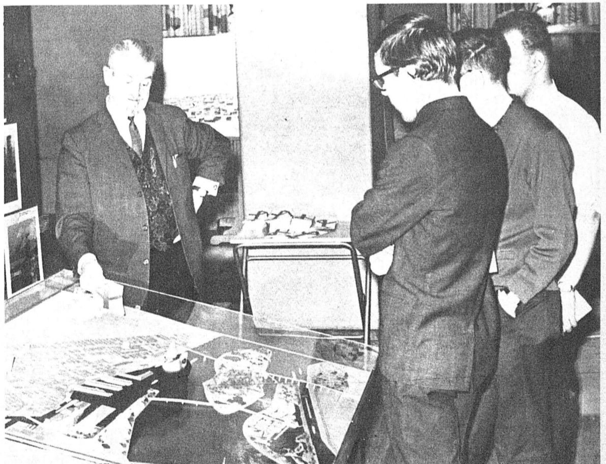
MONTREAL'S "EXPO '67" MOCK-UP . . . in Pybus Lounge exhibits