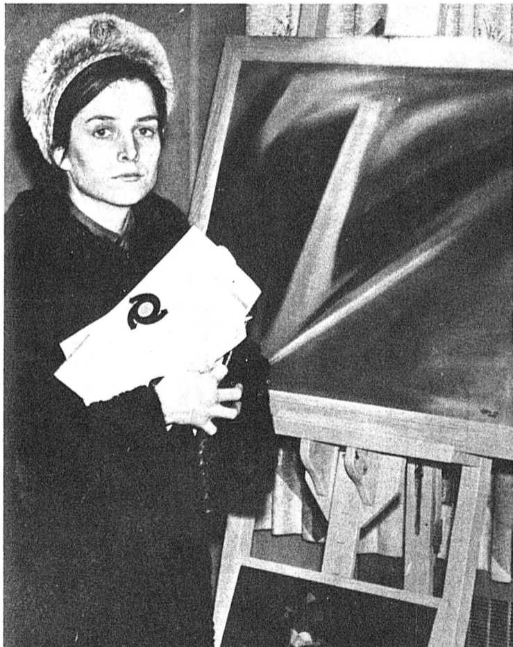
MODERN ART DISPLAY FROM QUEBEC . . . a look of approval?

They are filled with colorful pictures and English translations for those who are unilingual, but interested.