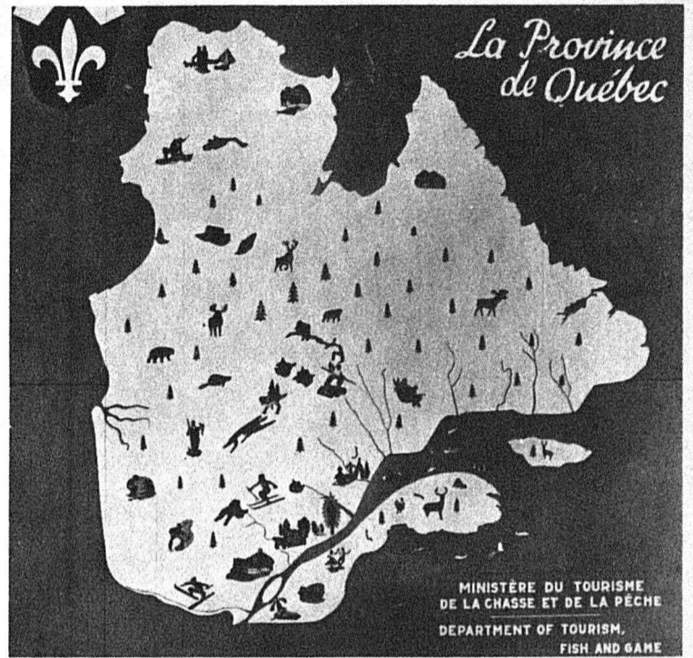
LA BELLE PROVINCE . . . de Quebec

From abstract art to old fashioned wood carvings, French Canada's many aspects are displayed this week in Pybus Lounge.