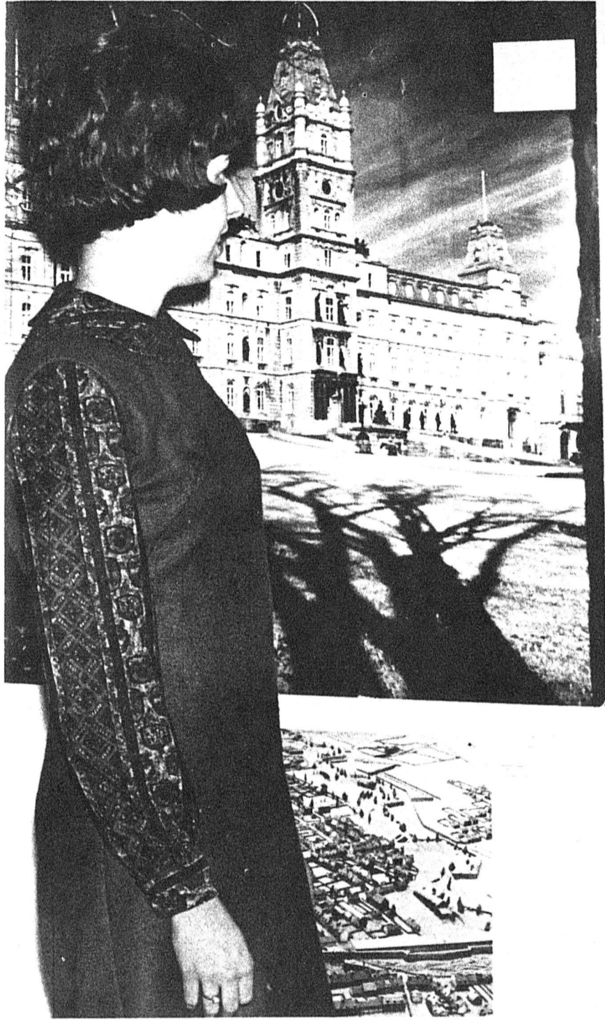
QUEBEC LEGISLATIVE BUILDINGS . . . part of pictorial displays