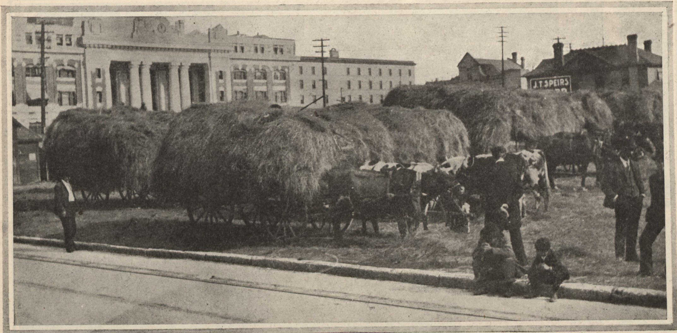
The Classical Facade of the New C.P.R. Station overlooks the Picturesque Hay Market