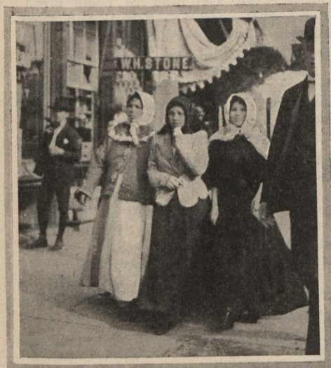
Galician girls make Main Street bright with their gaily-coloured kerchiefs

An everyday scene in the heart of the business section, and which illustrates Winnipeg's evolution from a frontier post to a metropolis