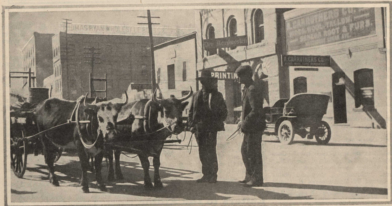
From Ox-Cart to Auto

An everyday scene in the heart of the business section, and which illustrates Winnipeg's evolution from a frontier post to a metropolis