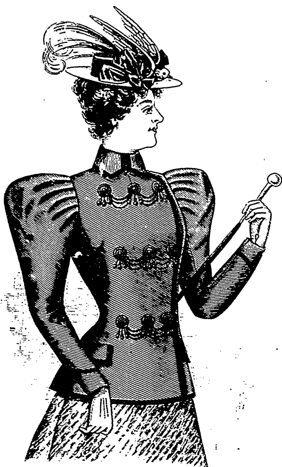
FIGURE No. 163 B. —This illustrates LADIES' COAT OR JACKET.—The pattern is No. 9407, price 1s. 3d. or 30 cents.

pleted by straight cuffs that are closed with link buttons below short slashes finished with a continuous underlap. As the col-