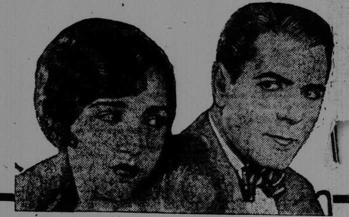
Bebe Daniels and Warner Baxter

FRIDAY PALACE SATURDAY TWO STARS HOOT GIBSON in "THE HURRICANE KID" HARRY LANGDON in "LUCKY STARS"