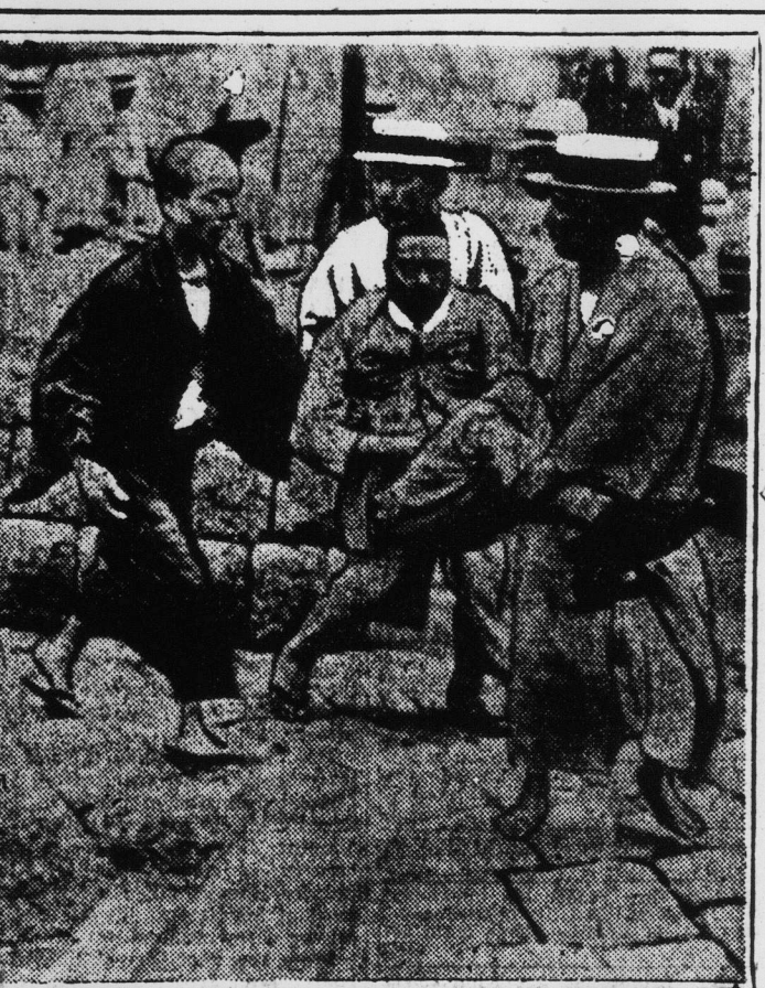
Rajah Mahendra Pratap, of Afghanistan, whose "radical" and anti-British activities brought him fame in India, is forcibly deported from Japan because of his failure to comply with passport regulations and his refusal to leave Japan. The photo shows plainclothesmen carrying the rebellious rajah to a ship at the port of Osaka.