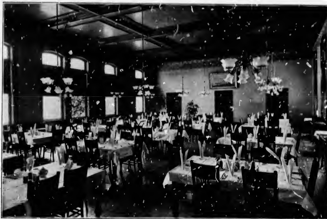
DINING ROOM, GRAND HOTEL.