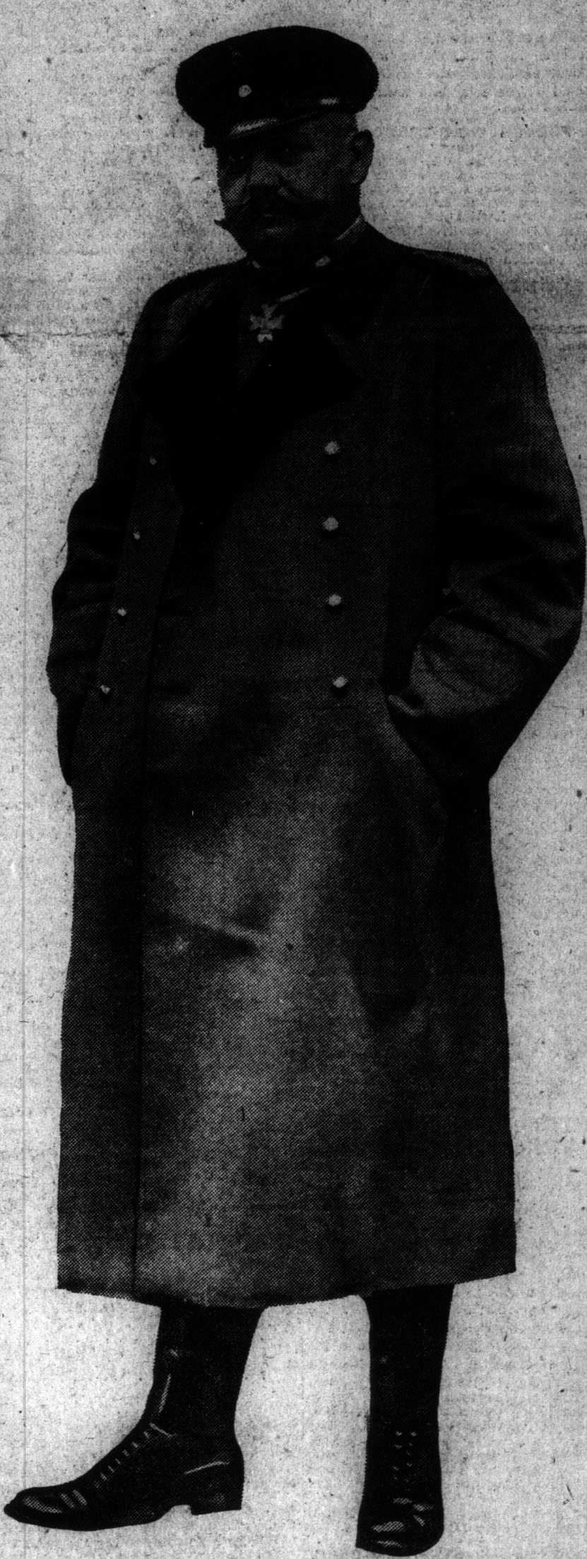
Field Marshal Paul Von Hindenburg, who has devoted a lifetime to study of strategy on the Russian-German frontier, where his armies now are putting his theories to the supreme test with little success, according to the latest advices from Petrograd.