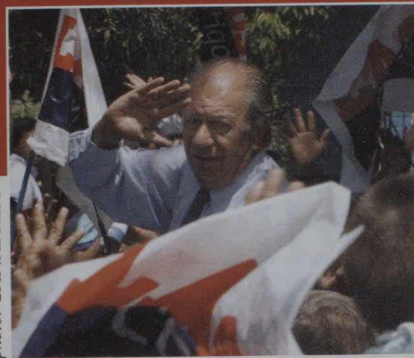
Newly elected Chilean President Ricardo Lagos

are now engaged in negotiations toward the establishment of a proposed Free Trade Area of the Americas by 2005.