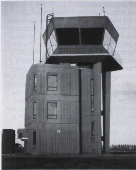
◀ Fixed control tower