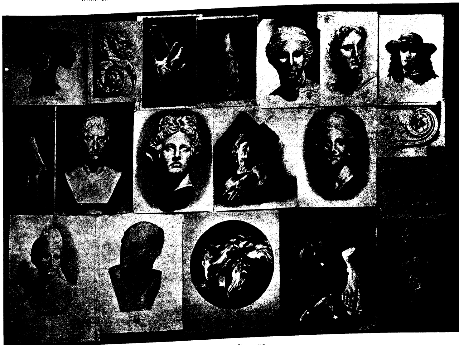
FREE HAND DRAWING.

EXHIBIT OF WORK DONE BY THE PUPILS OF THE INDUSTRIAL SCHOOLS UNDER THE DIRECTION OF THE COUNCIL OF ARTS AND MANUFACTURES OF THE PROVINCE OF QUEBEC.