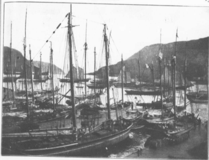
NEWFOUNDLAND—Fishing vessels in the Harbour of St. John's.