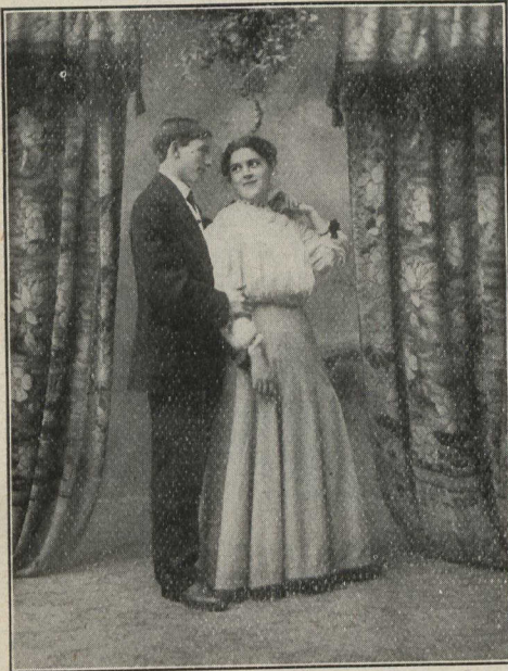
Under the Mistletoe

The mistletoe, as a Christmas decoration, seems to be indispensable. In the