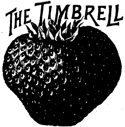
FIG. 653.—THE TIMBRELL.

The Timbrell is described thus: bloom late, imperfect; plant healthy, vigorous in growth, very hardy and productive; berry large, good quality, and a good shipper.