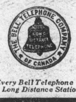
Every Bell Telephone a Long Distance Station

If you could gather into one hall the people you would like to do business with, and could tell them your story through a microphone so they could hear every word distinctly, is there any doubt in your mind that you would reap a rich reward of orders? How much would it cost you for such a hall, and for such a gathering together of all potential customers? Long Distance enables you to pick your audience, at very much less cost, and your prospects will hear your sales talk as distinctly as if you spoke through a microphone. The voice-reach of Long Distance includes everyone you could do business with. Speak! They will surely listen!