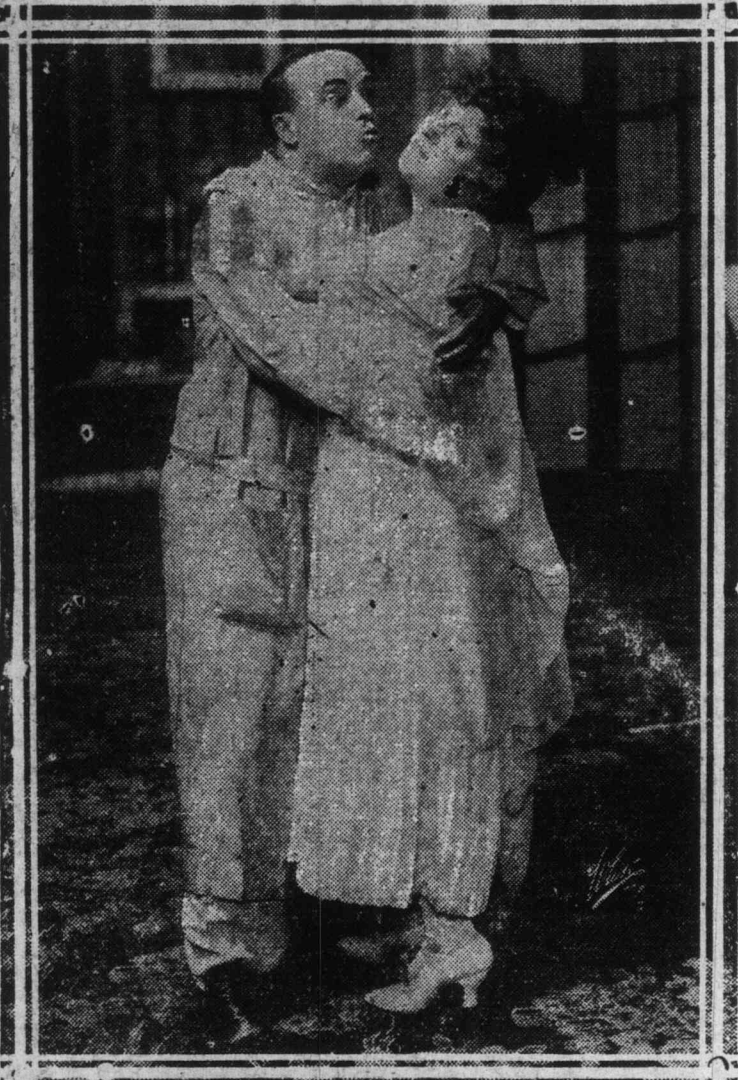
Scene from "Parlor, Bedroom and Bath" at the Grand, Saturday, Matinee and Evening.