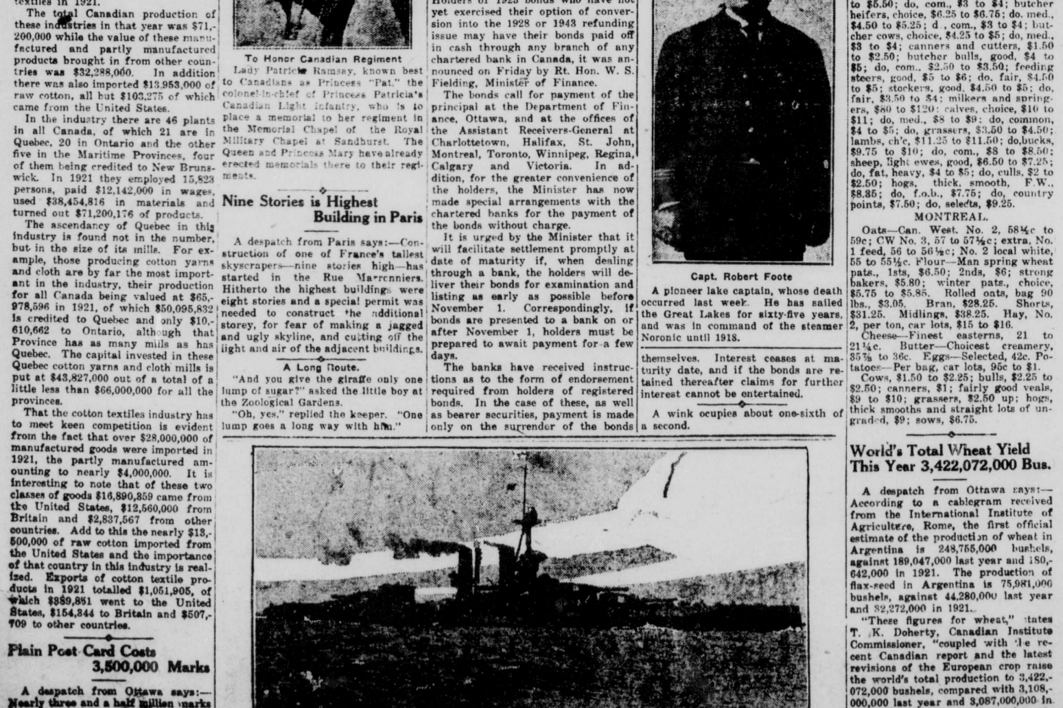
BRITAIN'S STRIKING POWER IN THE MEDITERRANEAN Britain is placing more and more of her naval power in the Mediterranean, and the announcement of the uster of the famous Iron Duke from the North Sea to the Mediterranean is in line with the new naval policy, piral Sir Cemend Brock will have the Iron Duke as his flagship. Some of the greatest and best of British this will be under his command.