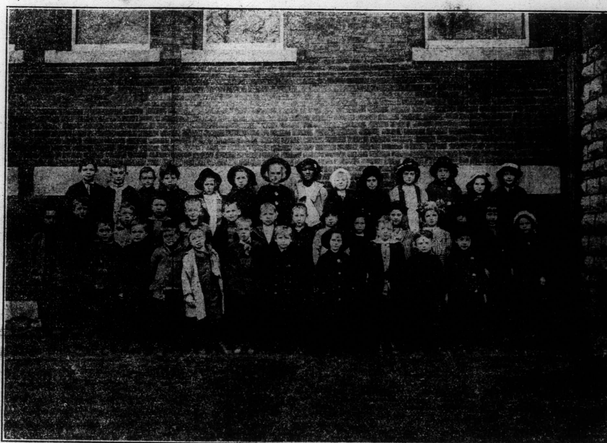
ALEXANDRA SCHOOL—DIVISION EIGHT