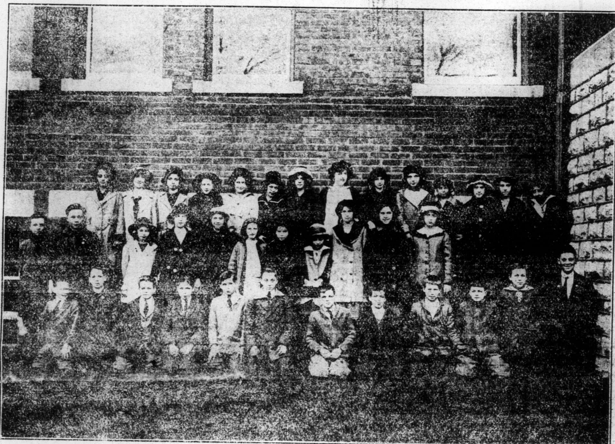
ALEXANDRA SCHOOL—DIVISION TWO