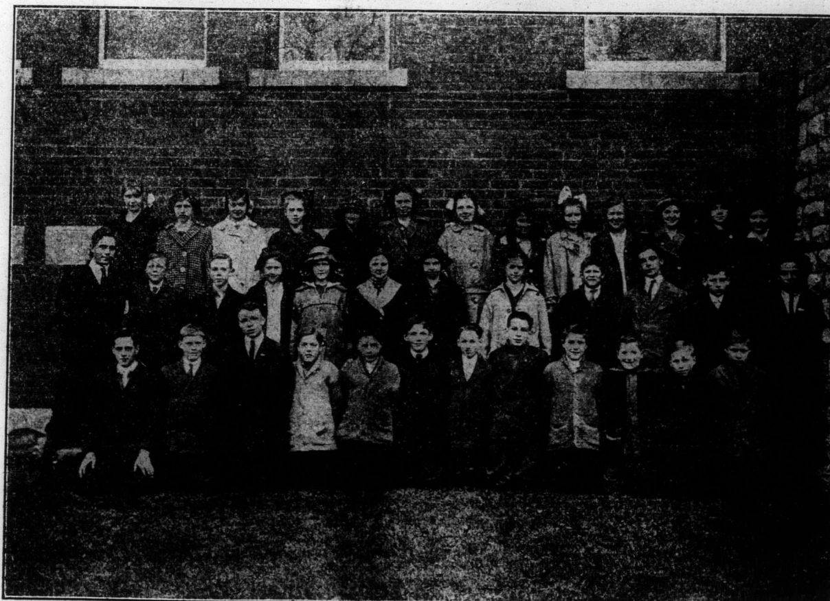
ALEXANDRA SCHOOL—DIVISION ONE