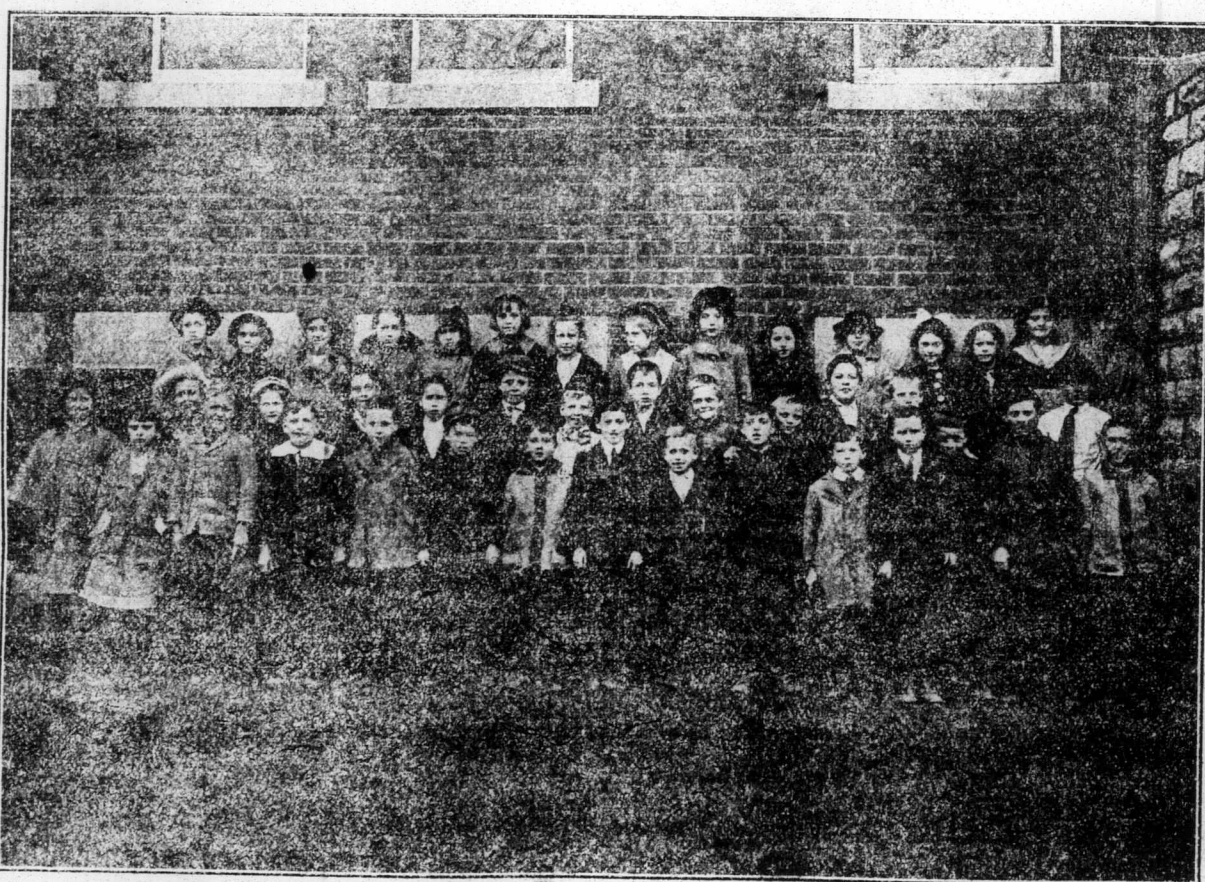
ALEXANDRA SCHOOL—DIVISION SEVEN