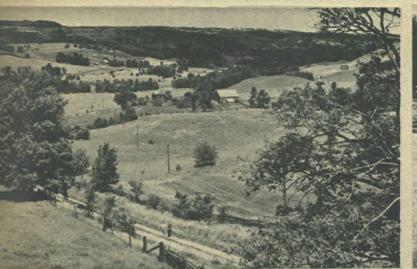
Farm lands border the St. Lawrence River.

Both snow and rainfall are generally light and crops depend largely upon rains during the growing season. In summer long hours of sunshine provide ideal conditions for rapid growth. In "dry belts" irrigation projects have turned the fields green with alfalfa and sweet clover.