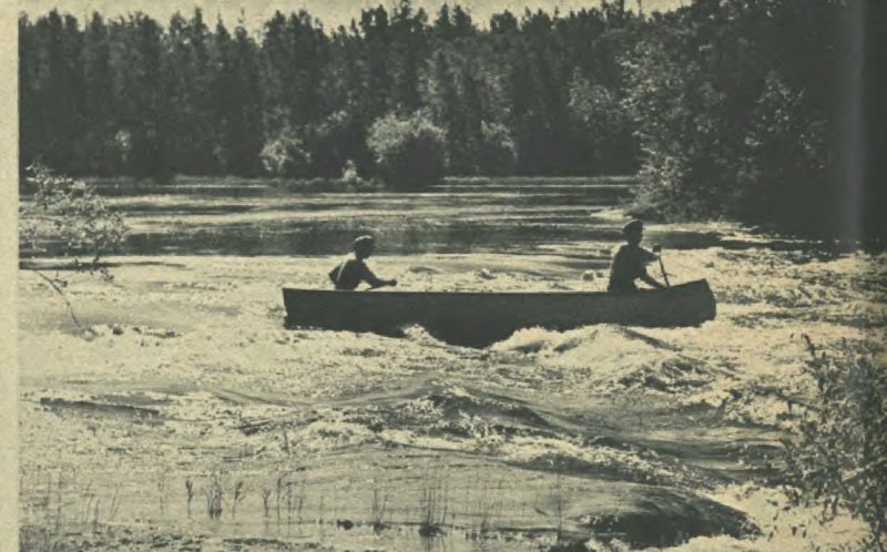
Canoes provide sport and transportation.

During the past three centuries the wild regions of the Precambrian Shield have provided one of the world's chief sources of luxury fur beaver, otter, fisher, muskrat, fox, mink, ermine, marten and lynx. The maze of rivers and lakes enables trappers to go far into the wilds by canoe.