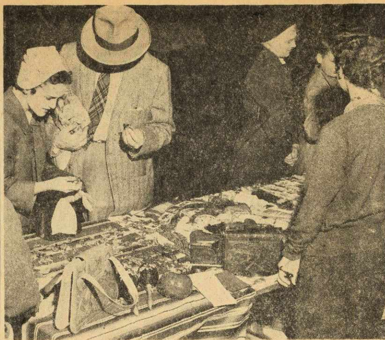
Shown above are several Haligonians examining a display at last week's WUSC Treasure Van Sale.