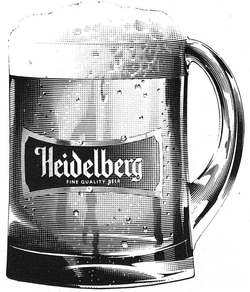
And that's the truth!