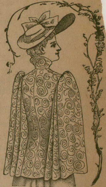
FIGURE No. 364 P.—LADIES' CAPE WRAP.—This illustrates Pattern No. 3733 (copyright), price 35 cents.