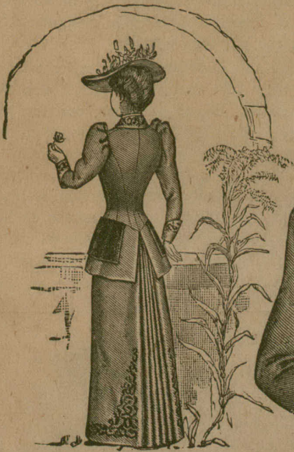
FIGURE No. 355 P.

The styles illustrated on the Plate and described in the Book are accurate, timely and elegant, and are the latest and best productions of our Artists in Europe and America. Patterns corresponding with these styles are issued simultaneously with them, and are at once placed on sale in all our various Depots and Agencies in the United States.