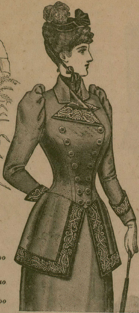
FIGURES Nos. 355 P and 356 P.—LADIES' COSTUME.—These two figures illustrate the same Pattern.—Ladies' Costume No. 3771 (copyright), price 40 cents.