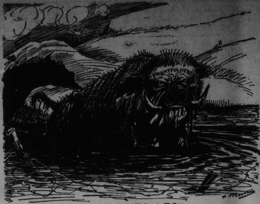
Forcing Him From Wallow to Wallow.

B. B. B. is manufactured only by T. J. MILBURN CO., LIMITED, Toronto, Ont.