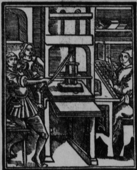
THE EARLIEST FORM OF THE PRINTING PRESS.

The simple wooden form of press, GUTENBERG'S IDEA.