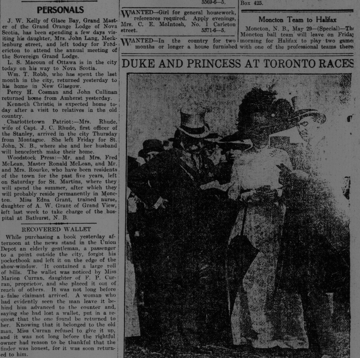
to work, but if it's only a job. I'll go larther," the caller replied. And from that minute he was on the pay roll.— Buffalo Express. Wrs. Jane Boyle, whose death, at the age of 101, has occurred at Swansea, was a regular smoker, and smoked until a few days before her death. Wrs. Jane Boyle, whose death, at the Boyle whose death, at the Woodbine race course. They are all evidently deeply interested in the product of the Woodbine race course. They are all evidently deeply interested in the product of the Woodbine race course.

TO LET-Furnished or unfurnished comfortable modern flat, eight roms, centrally located; hot water furnace, electric light, etc. Address "Nostrebor," P. O. Box 425.