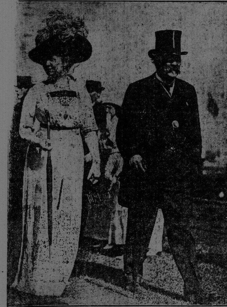
The Duchess of Connaught with SirEdmund Osler at the recent festivities in