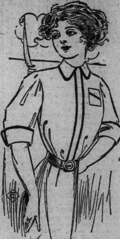
College Waist, 85c

Women's Shantung Silk Waists, extra heavy quality, natural color only; beautifully made, with front of wide and narrow tucks, fastening down centre and trimmed with silk-covered buttons; long sleeve, with shirt cuff; tucked collar; sizes 32 to 42. Price .98