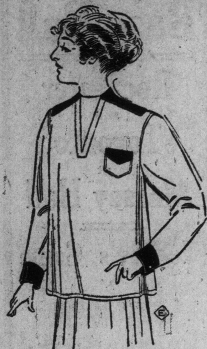
Middy Waist, 85c

Women's Shantung Silk Waists, extra heavy quality, natural color only; beautifully made, with front of wide and narrow tucks, fastening down centre and trimmed with silk-covered buttons; long sleeve, with shirt cuff; tucked collar; sizes 32 to 42. Price .98