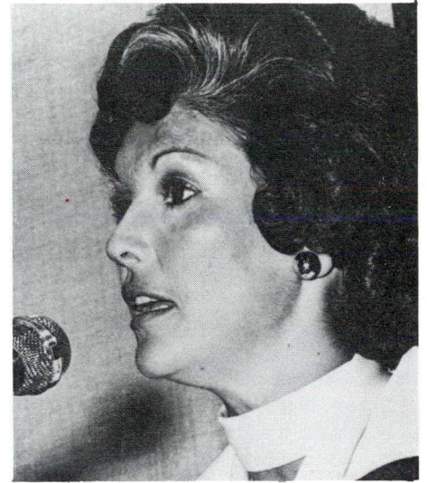
Iona Campagnolo was appointed Minister of State (Fitness and Sport).

Employers in Ontario paid $600,000 to female employees who were paid less than men doing the same jobs