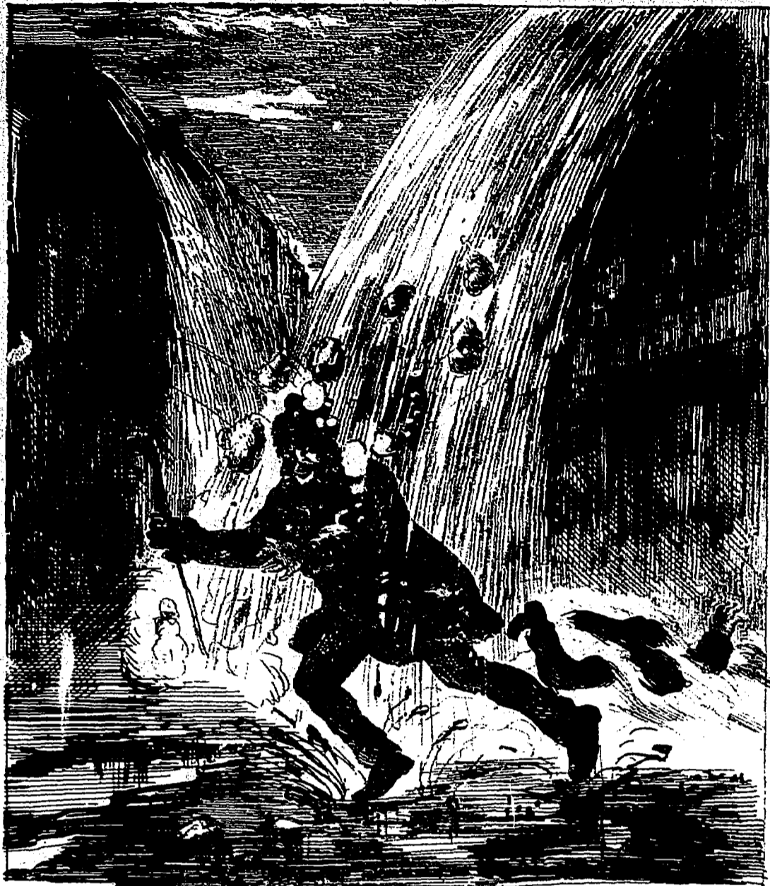
"Oh, what a falling off was there!"