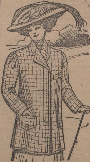
G 2303, N.M.

No. G2400. N.M., is a Smart Spring Coat (for both Ladies and Misses), of Striped Covert Coating, in both light fawn and brown tones, excellent quality. Prince Chap back, double breasted front, 23 inches long, the fancy pockets and coat sleeves are trimmed with buttons of self.