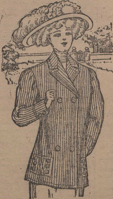
G 2400, N.M.

No. G2400. N.M., is a Smart Spring Coat (for both Ladies and Misses), of Striped Covert Coating, in both light fawn and brown tones, excellent quality. Prince Chap back, double breasted front, 23 inches long, the fancy pockets and coat sleeves are trimmed with buttons of self.