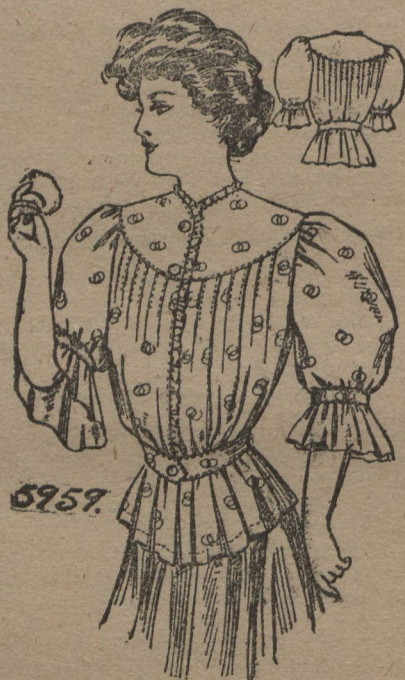
A CHARMING HOUSE JACKET. No. 5959.

This graceful walking skirt is given the fashionable close fit about the waist by the plaits being stitched to deep yoke depth, and allowed to flare below that point in well-pressed folds, thus producing the necessary fulness at the lower edge. This design is suitable for broadcloth, Panama, voile, and English suiting. For 26-inch waist measure 6 3/4 yards of 44-inch material will be required. Sizes for 22, 24, 26, 28, 30, and 32 inches waist measure.