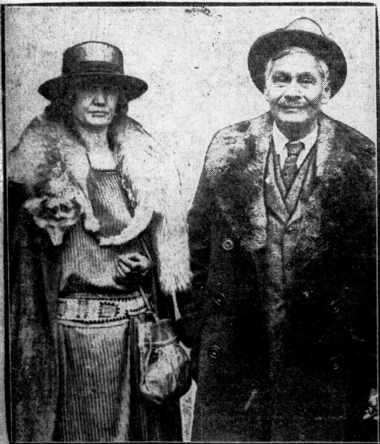
The world's richest Indian. He has now given away $1,100,000 and has only half a million left. He gave $550,000 to his wife.