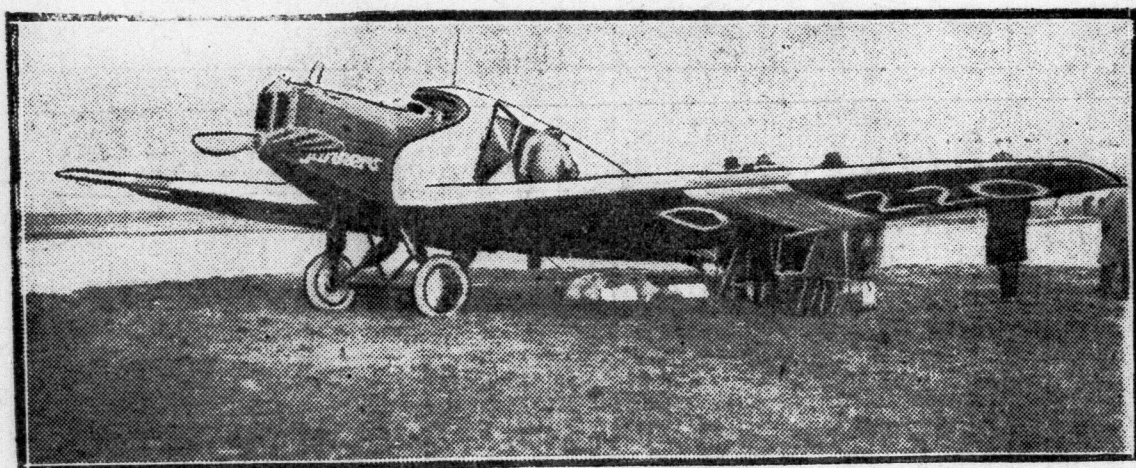
The second German aeroplane to visit England since the war. It reached Croyden on January 10th.