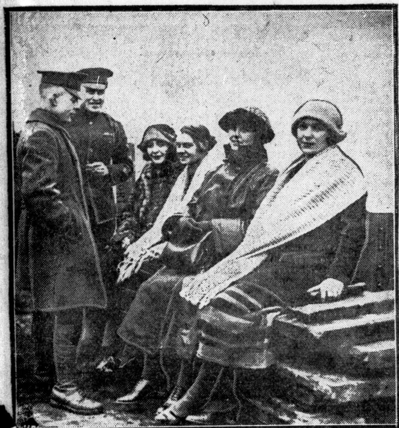
American soldiers of the army of the Rhine ready to embark for home with their German wives.