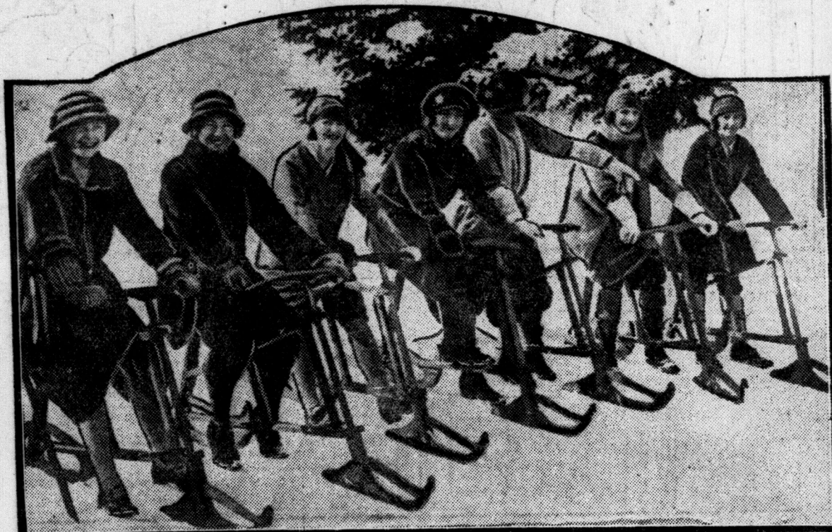
The latest in winter sports. A snow bicycle race at Murren, Switzerland.