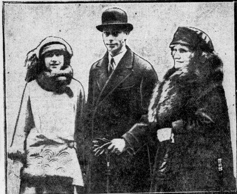
The Duke of York with Lady Elizabeth Bowes-Lyon, his fiancée, and her mother, the Countess of Strathmore, just before leaving for a short visit at Sandringham.