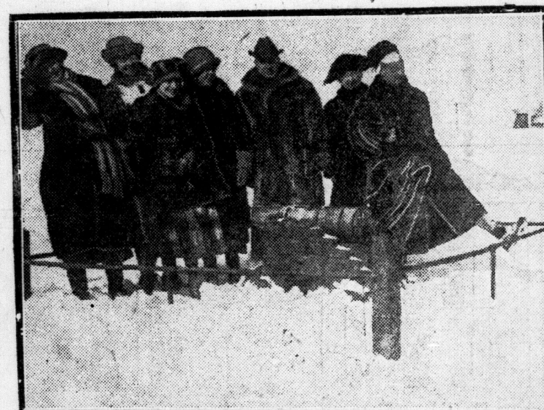
A group of Bostonians pay a visit to gun captured by the British at Bunker Hill in 1775. It is now in Quebec.