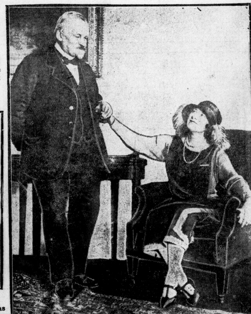
Mary Garden gets along famously with Dr. Coue, the noted exponent of autosuggestion. They posed together for the photographers in Boston.