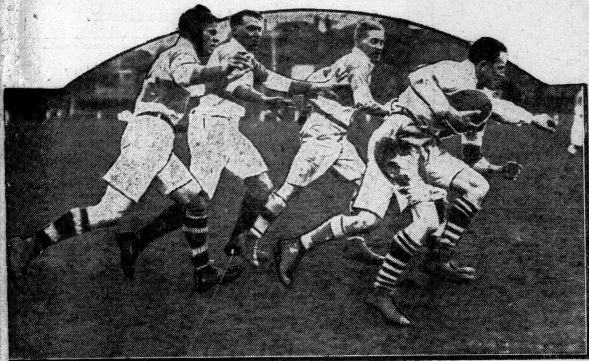
An Eastern Counties player gets away with the ball in a rugby game between Eastern Counties and Sussex at Richmond.