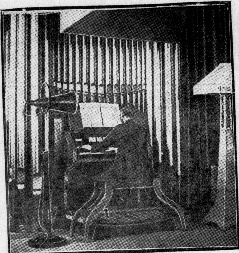
"CKAC" of the Montreal La Presse, the only radio station in the world which broadcasts both in English and in French.