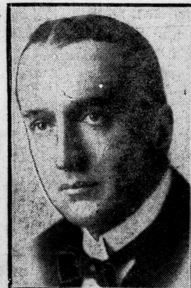
Stanley M. Bruce, who has been asked to form an administration in Australia to take the place of the one headed by Premier Hughes who has resigned.