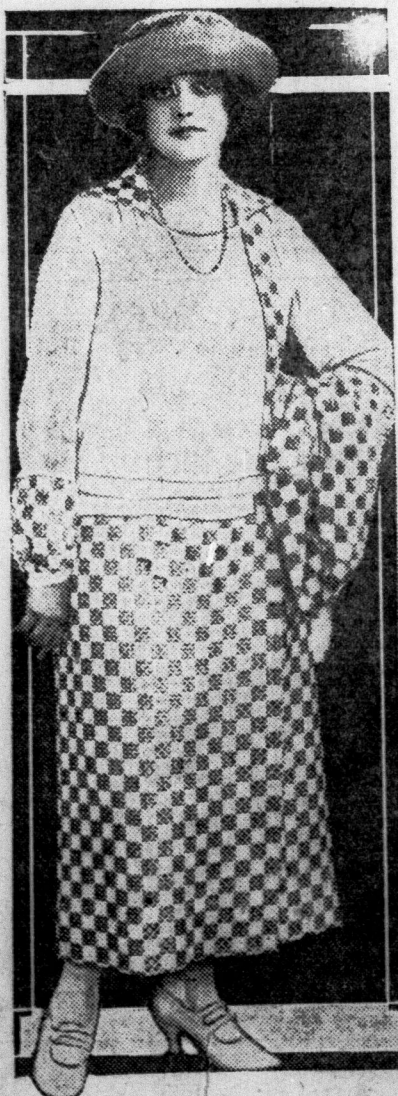
A three-piece costume of yellow and white pussy willow crepe for weather to