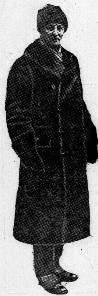
Sir Henry Newbolt, poet and author, who will lecture throughout Canada, arrives at St. John, N.B.