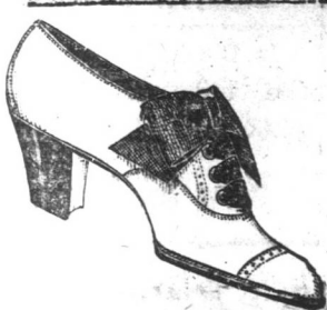
It's Low Shoe Time Again!

And many women are glad, because that means that there is nothing to prevent them from wearing the snappy Oxfords we are showing in many different leathers and styles. You will admire them. They are serviceable and reasonably priced, and some of the most comfortable footwear you can find.