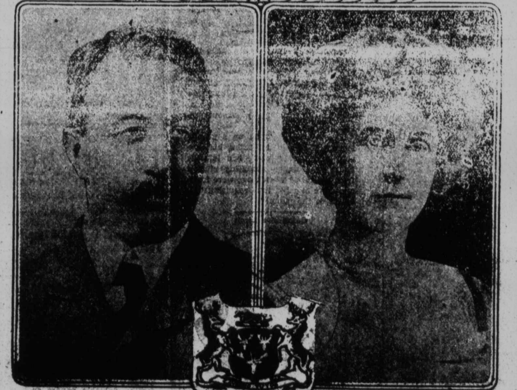
The Duke and Duchess of Devonshire.

The Military Service, or Conscription Bill was signed at Toronto on Tuesday by the Duke of Devonshire and is now law. The dates of calling out of the first drafts has not been announced.