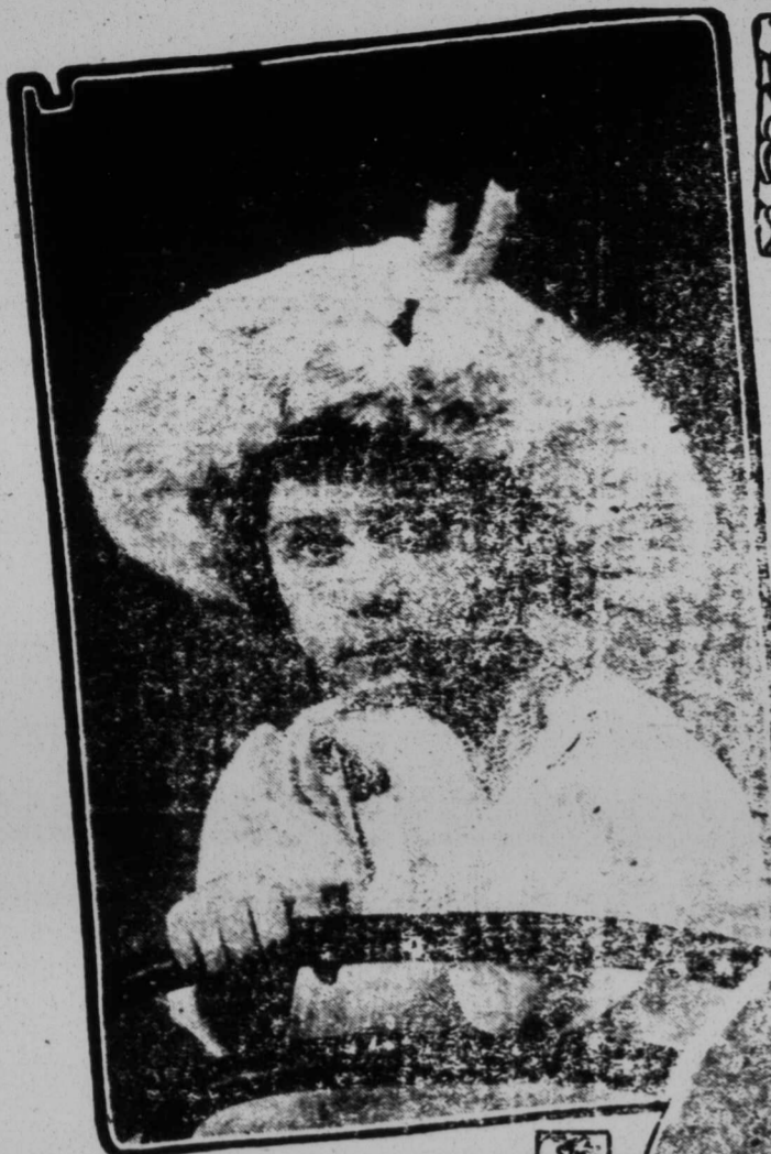
For Baby Bunting

WHILE the little lady is putting on any one of these becoming hats, we must doff ours in honor to the designers, for the variety, style and originality are features that it would be difficult to equal in any other group.