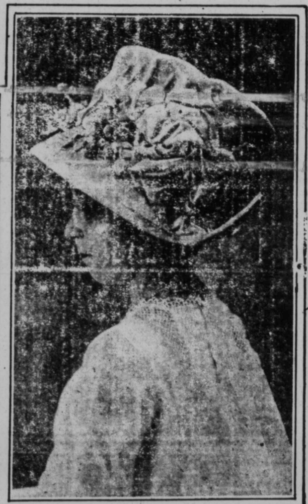
The Forget-me-not Hat

between which are large rosettes of blue ribbon. The color of any flower can be suggested after this model with satisfactory results, a rose hat, a daisy hat, a ragged-robin hat being a few hints to clever mothers.