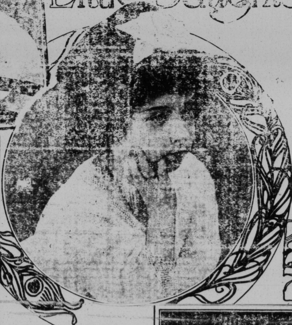
Practical Black with a Pink Rose

Practical black velvet forms the high crown of a plain peach-basket model. This has a rose quilling of black ribbon on the edge, and in front is placed a handmade rose of pink silk, which is swirled around in the favorite method. Any dark color with a touch of bright in front would be