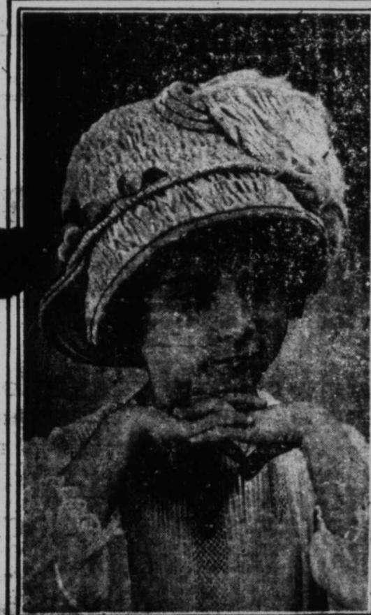
The Shirred "Thimble"

The forget-me-not model is in pale blue, with a smartly turned-up brim at the back. The crown is puffed, and a binding of blue ribbon gives a neat finish. Around the crown are wreaths of forget-me-nots,