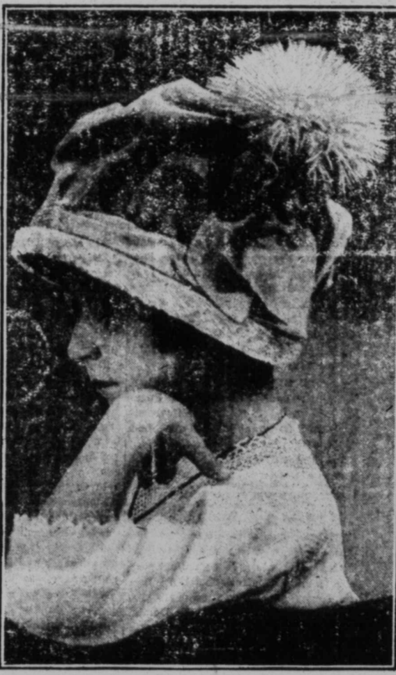
Of Velvet, Lace and a Pompon

Hats on! It is your duty to see that the right ones are chosen.