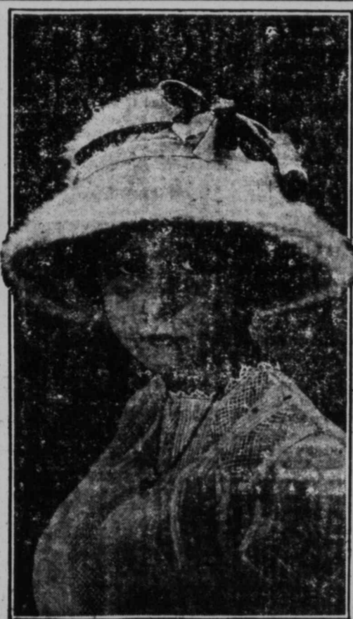
A Study in Brown and White