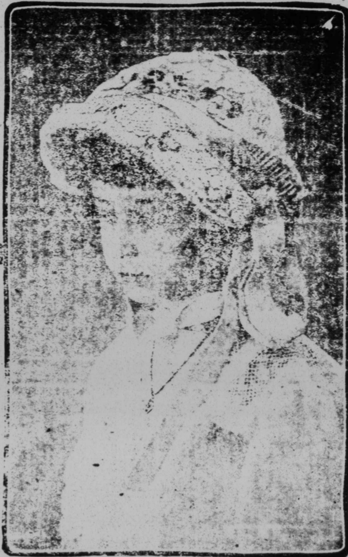
With Velvet Strings

The quaintness of a little bonnet with strings is