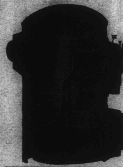
This cut represents the Perfect Furnace