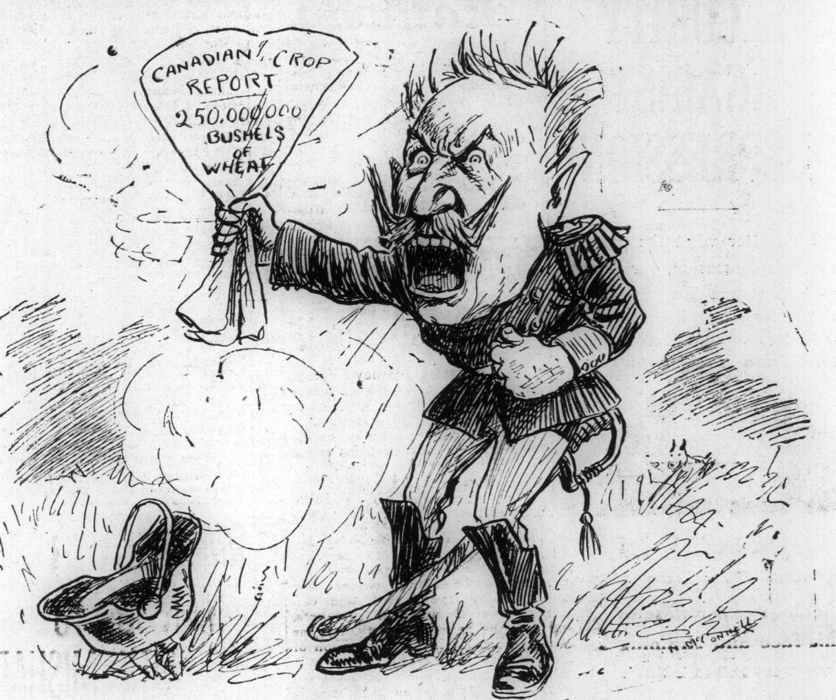
Increased Canadian agriculture puts a crimp in the Kaiser's Kulture increase.