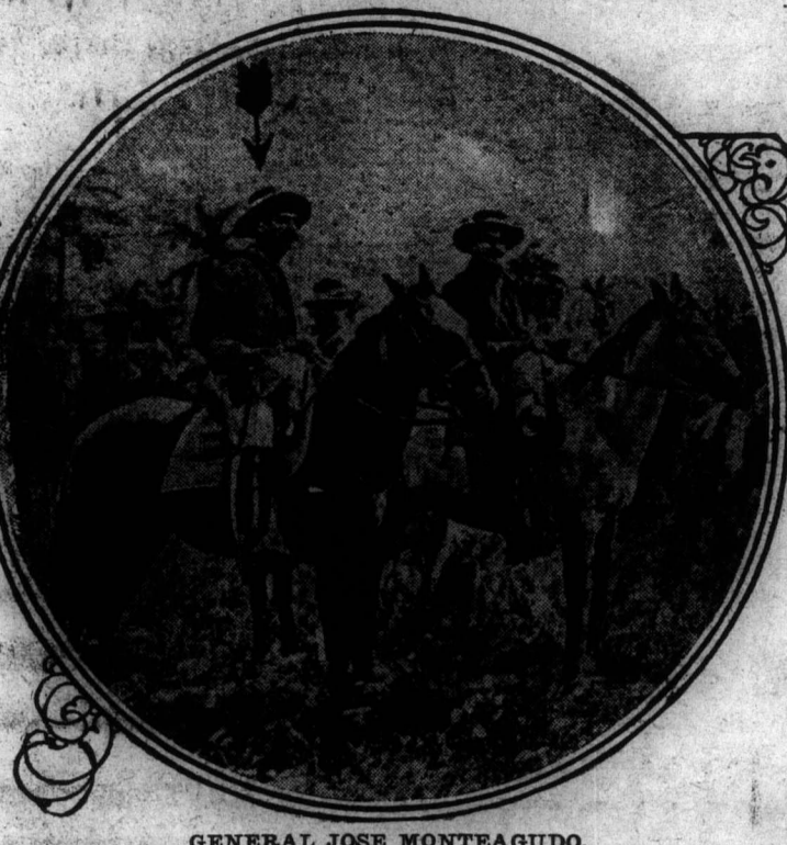
GENERAL JOSE MONTEAGUDO.

It is reported that General Jose Monteaquedo, Commander in Chief of the Cuban Army, will meet Jose Mirone Gomez, former President of Cuba. The rumor also states that the former President is fomenting a revolution in Cuba, with a view to regaining his lost power.