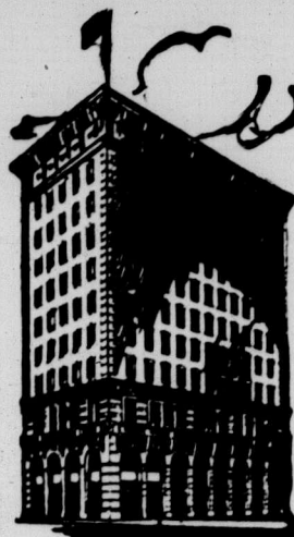
Head Office, Winnipeg