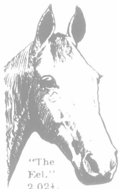
"The Fel." 2.024.