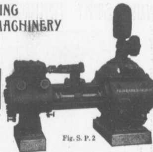
Fig. S. P. 2