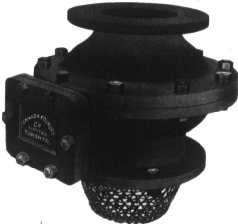
VERTICAL FOOT VALVE, 8 INCHES AND SMALLER.

Flanges will be furnished blank or drilled to standard table as given on page 7.