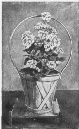
Fig. 7.—A simple fruit basket used for a single flower.

The front of the box opens on a hinge at the base, allowing for the removal of the plants when desired. Wires are stretched from top to bottom for the vines to twine upon. The screen has a very charming effect. It stands firmly, as all the weight is at the base. It may be easily moved, thus allowing it to be used as a background for brilliant blossoms. Several of these screens placed side by side would be very effective in banking up the side of a room when special floral decorations are needed for any festive occasion.