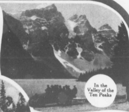
In the Valley of the Ten Peaks