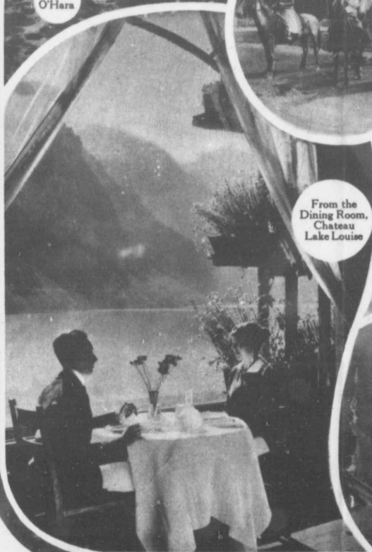
From the Dining Room, Chateau Lake Louise