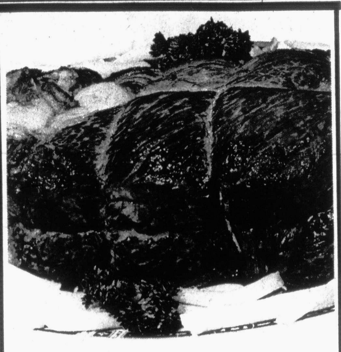
The Beef Information Centre is sponsoring a course on beef-buying and cooking at Square One Shopping Centre on May 24 and June 1 at 8 p.m. For details, call 766-2787.

Showplace —Showplace Mississauga is open to the public May 26 to June 18. The Mississauga Hospital Auxiliary has transformed the Adamson estate into an interior-design showplace with the help of leading designers and landscapers. Admission is $3.50. 274-7816.