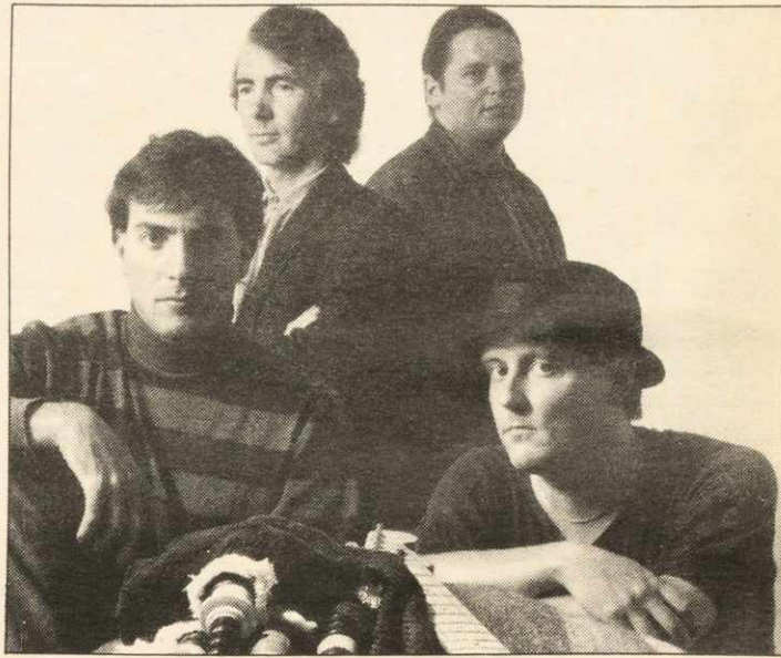
Rawlins Cross in a completely natural pose.

In general, Fall Orientation Week '91 was a huge success. As Wallace puts it, "attendance was amazing... even at the daytime events... ticket sales were very good,